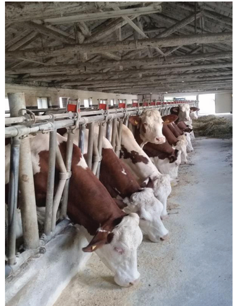
Figure 4. Housing of dairy cows in the Moara Domneasca farm

The microbiological analysis of milk can offer valuable information on the hygiene conditions in stalls, respectively during milking, on the conditions under which the primary treatment of the milk is made and on the health of the animals.