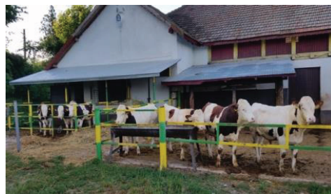
Figure 1. Image of the Moara Domneasca Cattle Farm

The milk produced by farm is sold directly via 2 milk vending machines or is used for the preparation of fresh cheese.