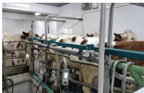
Figure 2. Image from the milking stalls

In 2017 the farm produced 121.19 tons of milk, which was used as follows: 64.5% was sold as fresh milk through dispensers, 9.2% was used for the feeding of calves, 25.4% turned into cheese and 0.8% was distorted because the quality was not good (Table 3).