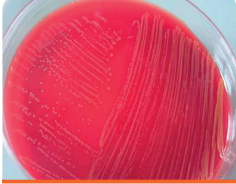
Figure 2. Growth of Moraxella bovis on blood agar

but cannot completely prevent morbidity. Do not forget that the main method of prophylaxis is the quarantine of all newly admitted animals, which are subjected to mandatory clinical examination and diagnostic testing, vaccination according to indications.