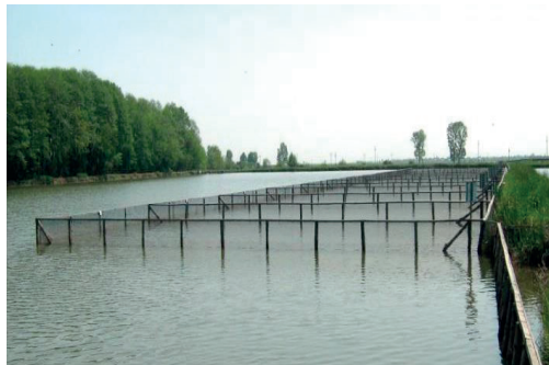
Figure 1. Battery of net pens located in the pond (Original photo)

1. The first growth model in the combined system involved the placement of intensive growth modules (net pens battery) in a fish pond (Figure 1).