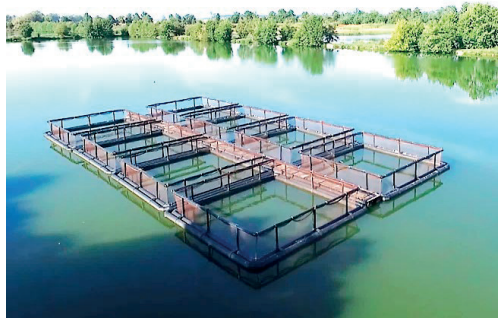
Figure 2. The floating cages platform located in the pond (Original photo)

2. The second growth model in the combined system involved the construction and placement of a floating cages module in a fish pond. Intensive rearing of the following fish species was carried out: paddlefish ( Polyodon spathula ), tilapia ( Oreochromis niloticus ) and carp ( Cyprinus carpio ) (Figure 2).