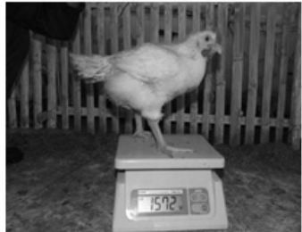
Body weight 5 weeks old