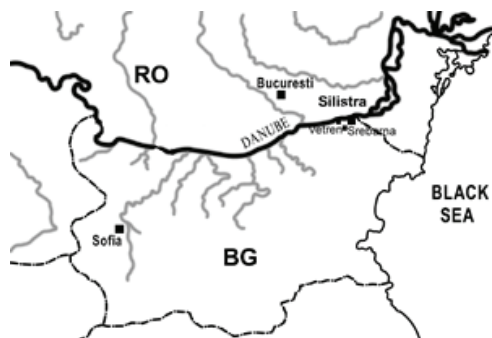
Figure 1. Danube River and Lake Srebarna

During June, 2012 sediments, fish and fish parasites were collected and examined from the Lower Danube River (village of Vetren, Bulgarian part) and Lake Srebarna, Fig. 1: