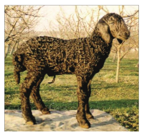
Figure 1. Moldavian Karakul lamb with excellent extension of curling

Below knee, as a rule, are smooths or moarat drawing. At the some lambs, the moire drawing can also be seen on the cheeks (Figure 1).