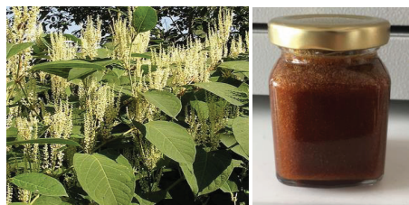
Figure 1. Fallopia japonica invasive plant and honey

Scientific studies show that the darker the honey, the higher its bio-active properties are. Honey obtained from nectar of this plant being a mild-flavoured version of buckwheat honey, is dark in colour (Figure 1), appearing dark red when held to light. The present study aim to determine the chemical composition of Japanese knotweed honey and their bioactive properties derived from the chemical composition.