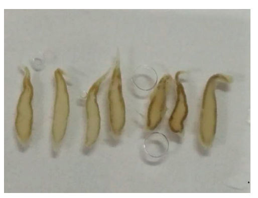
Figure 2. General view of the monogenean Mazocreas alosae detached from the Pontic shad gills