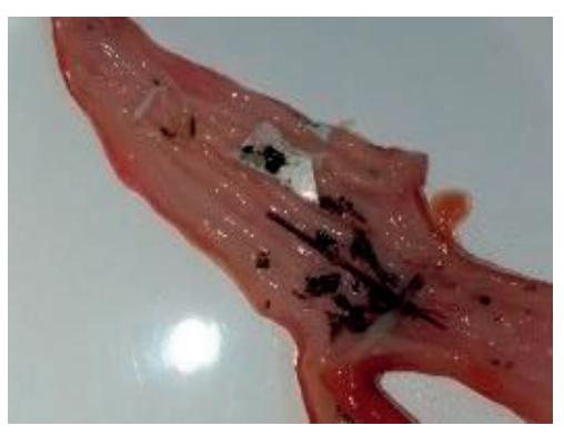
Figure 4. Plastics particles present into the shad's digestive tract