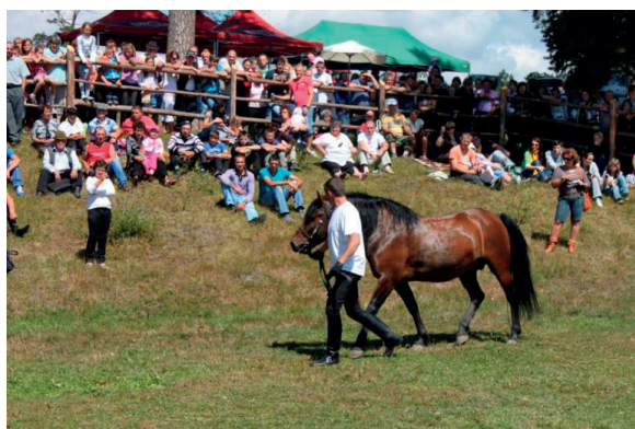
Figure 1. Ranking of sire stallions in Lucina studfarm

where q represents the standardized amplitude read from the table at the desired significance level ( \alpha ), p being the number of groups, and GL_e - degrees of freedom from the intragroup component of the variance analysis table. The value is obtained by the fact that MPE is the intragroup squares average value, and n is the average size of the groups. Applying Fisher or Tukey tests had the advantage to highlight, to allows us to see between which families we recorded significant differences.