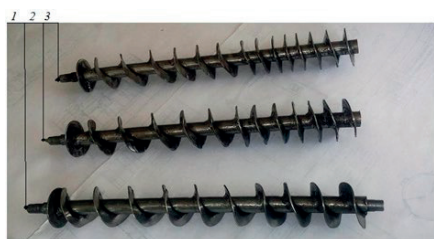
Figure 3. A set of augers with a variable pitch in the sections: 1 - a screw with a pitch change of 20 mm, at t_0 = 0.06 m; 2 - auger with a step change of 15 mm, at t_0 = 0.06 m; 3 - auger with a step change of 10 mm, at t_0 = 0.06 m

To implement a three-factor experiment, in order to give the factor x_2 (change of the screw pitch in sections) an intermediate (zero) value of the level of variation, a set of replaceable screws with the first pitch t = 0.06 m was made (Figure 3).