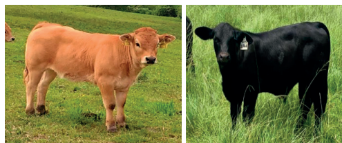
Figure 3. Aubrac and Aberdeen Angus cattle

registered between 2019-2021. In this study, 80 animals were studied, 40 of the Aubrac breed and 40 of the Aberdeen Angus breed, following the weaning weight (age of 7 months) and the average daily increase of the animals, which benefit from similar exploitation conditions (Figure 3).