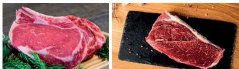
Figure 2. Aberdeen Angus beef

The Angus breed is also one of the most popular meat breeds in the country. The Aberdeen Angus breed is native to Scotland; This breed was imported to Romania at the end of 2007 (Gociman et al., 2019). Cows are animals that adapt easily to climatic and environmental conditions, being easy to exploit and meat has special nutritional proportions (Bartoň et al., 2006). It is an excellent breed for extensive growing systems, well suited for grazing, light calving. Cow weight: 500-700 kg, bull weight 800-1000 kg (Mukhamed Shakhmurzov et al., 2021). Fine, marbled meat highly prized (Figure 2).