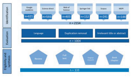
Figure 1. Identification of relevant information