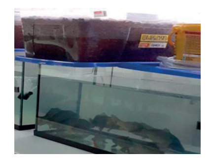
Figure 1. Recirculation aquaculture system (RAS) used in the study and compartments with expanded clay aggregates as biofiltration substrates. The water circulated through an overflow in the biofiltration compartment and returned through a submersible pump

containing 120 L of treated water fitted with air stones to provide an adequate mixture of oxygen and water in the aquarium.